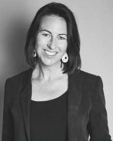
Sally Quinn Chair